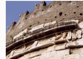
Tomba Cecilia Metella, I sec. a. C.

In the last section of the Agro Romano we propose the Reginae Viarum: a fascinating path, today called Via Appia Antica, through the funeral monuments of the Roman noble families.