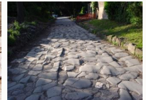
Via Appia Antica